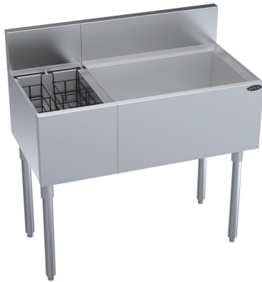
KR19-M36R-10 shown without optional Speedrail