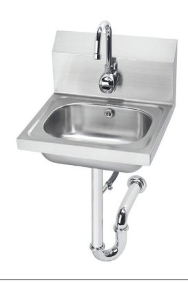
HS-13 16" Wide Hand Sink with Electronic Faucet, P-Trap,Overflow and Soap & Towel Dispenser