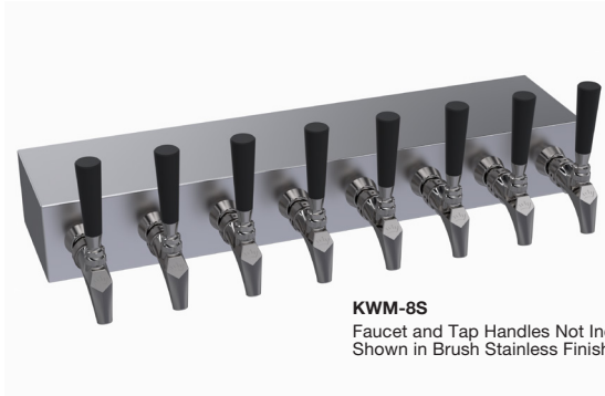
KWM-8S Faucet and Tap Handles Not Included Shown in Brush Stainless Finish