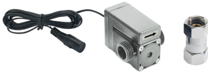
16-501 Hydro Generator