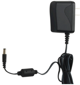
16-199 AC Adapter