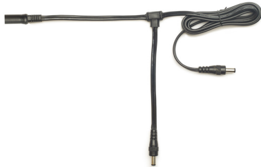
16-513 Daisy Chain Extension Cable