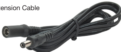
16-514 5' Long Extension Cable