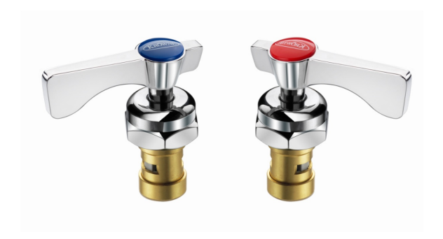
21-308L & 21-309L