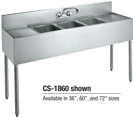
CS-1860 shown Available in 36", 60", and 72" sizes